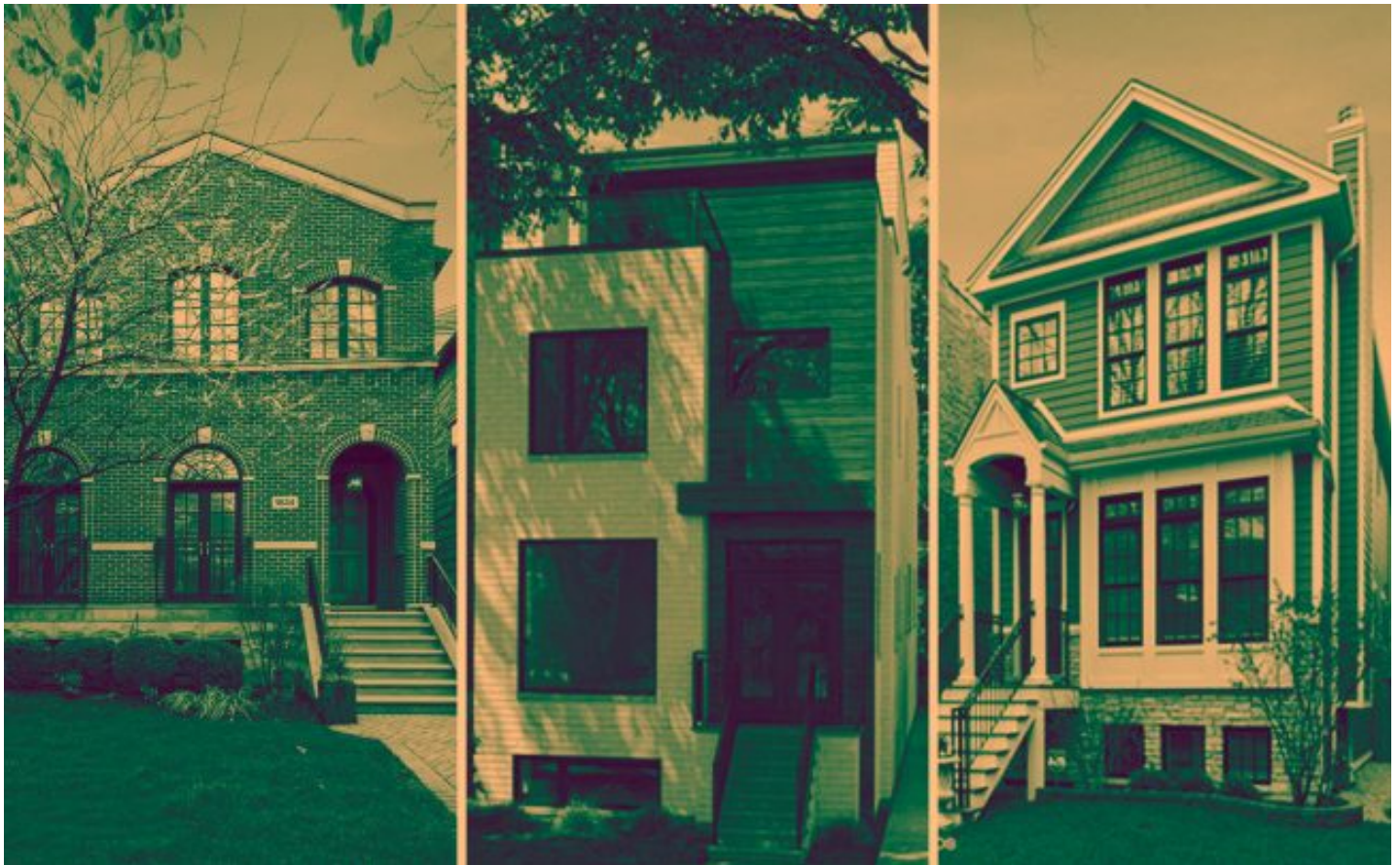
From left: 1834 W. Larchmont Ave., 3644 N. Bosworth Ave. and 2051 W. Grace St.